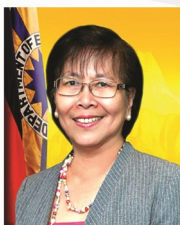
ZENAIDA Y. MONSADA Former Secretary Department of Energy