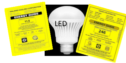
Use energy saving lights and household appliances.

Set timers on electrical appliances and devices based on what time of the day you will be using them.