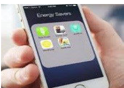
Track your electricity usage with applications.

Unplug chargers and other electronics when not in use.