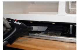
Vacuum refrigerator coils twice yearly to keep the compressor running efficiently for reduced energy usage.

Try redecorating for efficiency. Hang light colored curtains in your rooms and also use light colored paint on walls and ceilings.