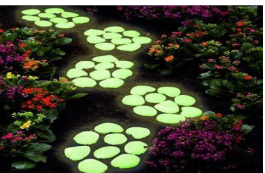
To save electricity in the garden, paint different sized rocks with glow in the dark paint. At night time you have a beautiful ambient light glowing in

Do carpooling. It does not only reduce traffic, it also reduces CO 2 emission.