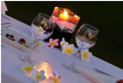
Have candle lit dinners.

Saving energy means decreasing the amount of energy used while achieving a similar outcome of end use. Using less energy has lots of benefits – you can save money and help the environment. There are many sources on the web that give you ideas of what you can do to save energy. Here are a few ideas to get you started: