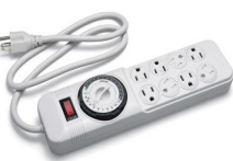
Put larger items such as televisions and computers on power-strips, and flip the switch to off when the items are not being used.