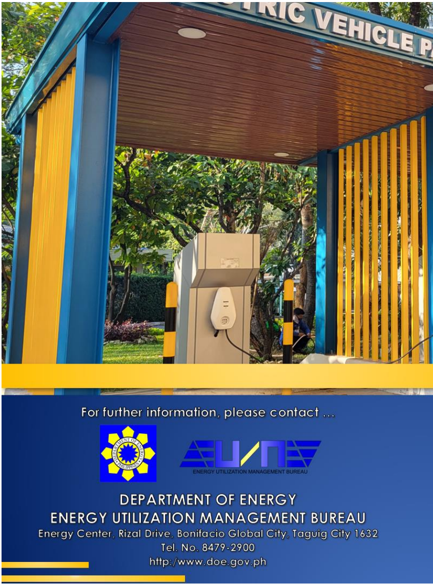
Figure 2. Sample Back Cover (subject to change)