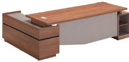
LV-EXR2000 Freestanding Table